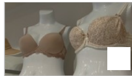
Saggy Breasts, Back Pain: Is Your Bra to Blame?