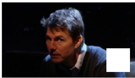
Tom Cruise Puts Dramatic Twist on Kimmel's Fake Movie Lines